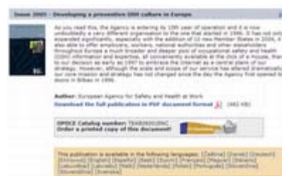
Publication detail view

Inside the folder, you can add "Publication" objects. Each Publication object represents one publication and stores metadata about that publication like Title, Description, Publication date and Author. It provides a detailed view on that publication containing all available metainformation. It also contains a quick upload feature to quickly upload the publication pdf files.