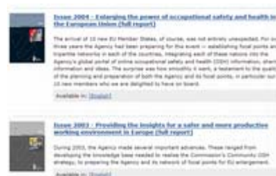
Publication folder view

If you want to add publications, you need to add a "Publication Folder" first. The Publication Folder is used to represent a section of publications. It provides a special view to display a list of its contained publications together with an image and a language box to quickly download a publication in a specific language. For the content editor it provides a facility to quickly upload several publications using the bulk uploader. Each uploaded folder with pdf files is thereby converted to a publication object.